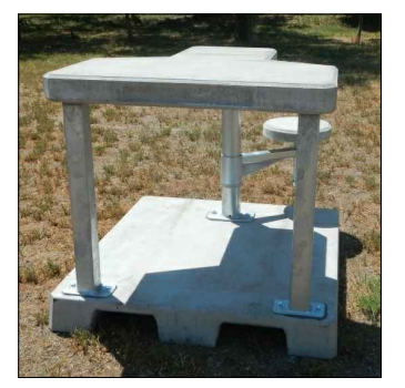
SHOOTING BENCH INSTALLED ON PAD