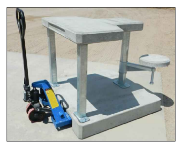
FASILY MOVABLE WITH A PALLET JACK

(6) 1/2" NATURAL COARSE THREAD GALVÁNIZED STEEL INSERTS CAST IN